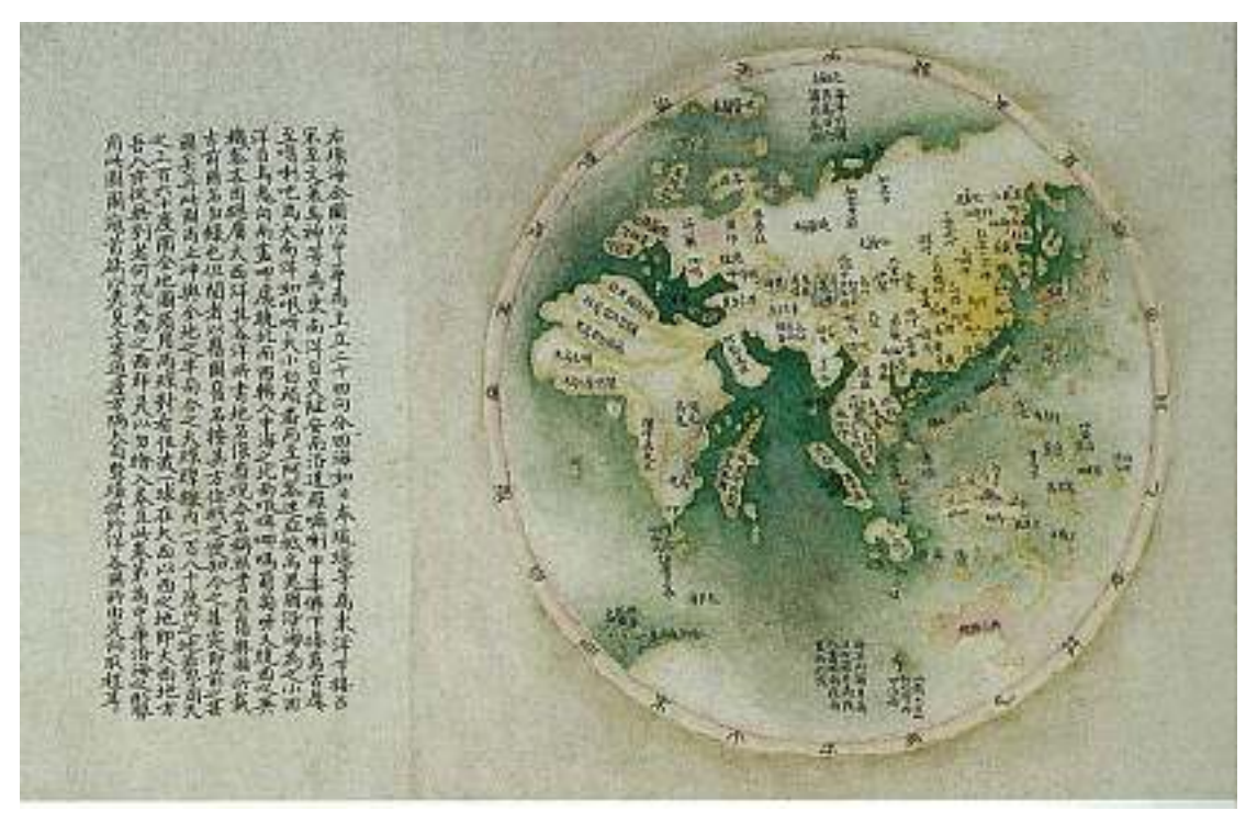
Figure 2. General Maritime Map.

The General Maritime Map has some explanatory notes on its left side that tell us that it was based on an "old terrestrial map (jiu yu tu)", which was based on an "ancient map (gu qian tu)". The interesting thing is the term of "ancient map (gu qian tu)". "Gu" in Chinese means death or passed. In 1798 China was ruled by Qing Dynasty, which did not allow any person to call anything of this dynasty as "ancient". Any person who misused this term would be thought to be cursing the Qing Dynasty to die and would be prosecuted for his error. Thus we may see that the so-called "ancient map (gu qian tu)" described in the notes was earlier than Qing Dynasty. Additionally the notes continue to tell us that the General Maritime Map is only "a half size of the old map", while the latter consisted of two spheres and "shall be viewed comparing each other".